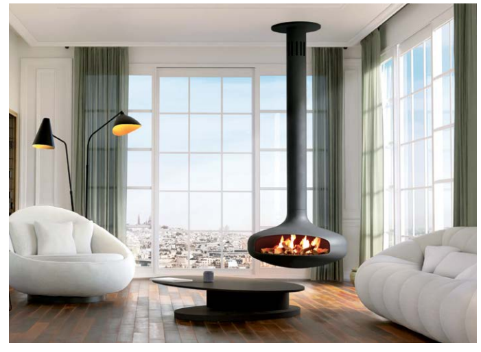
DOMOFOCUS BIOETHANOL @DOMINIQUE IMBERT