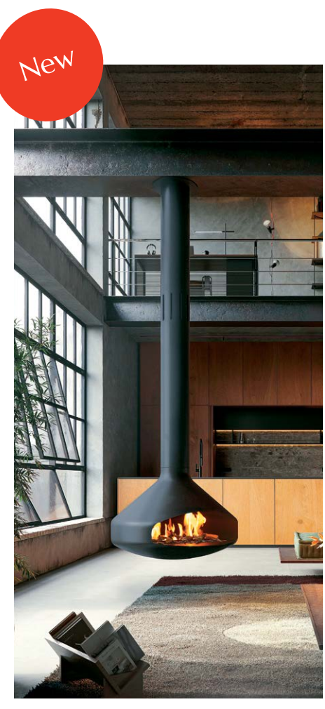
ERGOFOCUS BIOETHANOL @DOMINIQUE IMBERT

2024 promises to be another exceptional year for Focus, with the arrival of its new bioethanol range transforming the landscape of contemporary fireplaces. As elegant as ever with their suspended design, the Ergofocus, Gyrofocus and Domofocus are now available in a version fuelled by bioethanol.