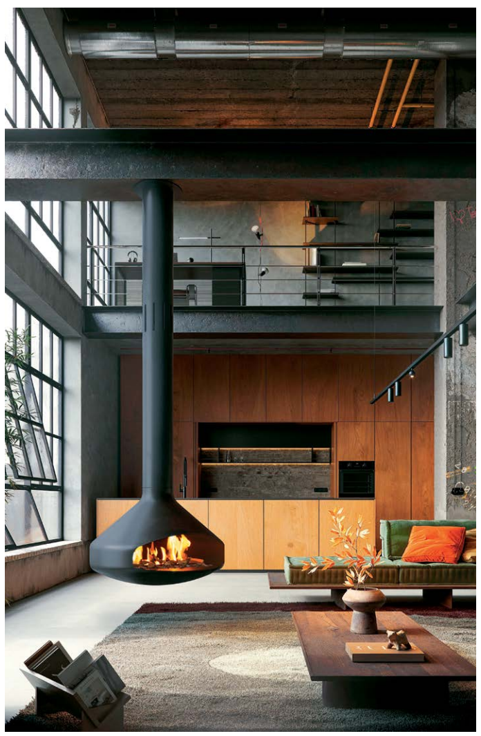
ERGOFOCUS BIOETHANOL