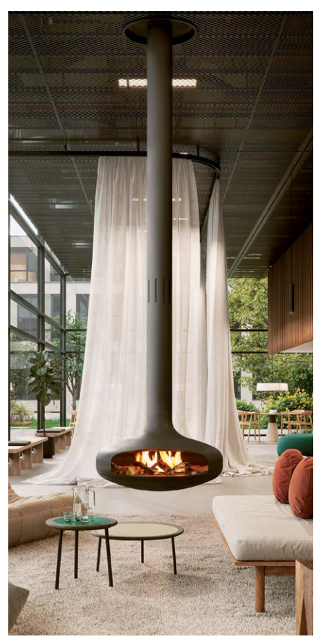
DOMOFOCUS BIOETHANOL @DOMINIQUE IMBERT

While these fireplaces still stand out by levitating above the ground, the fire is now fuelled by bioethanol.