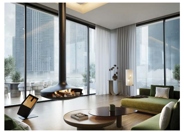
GYROFOCUS BIOETHANOL