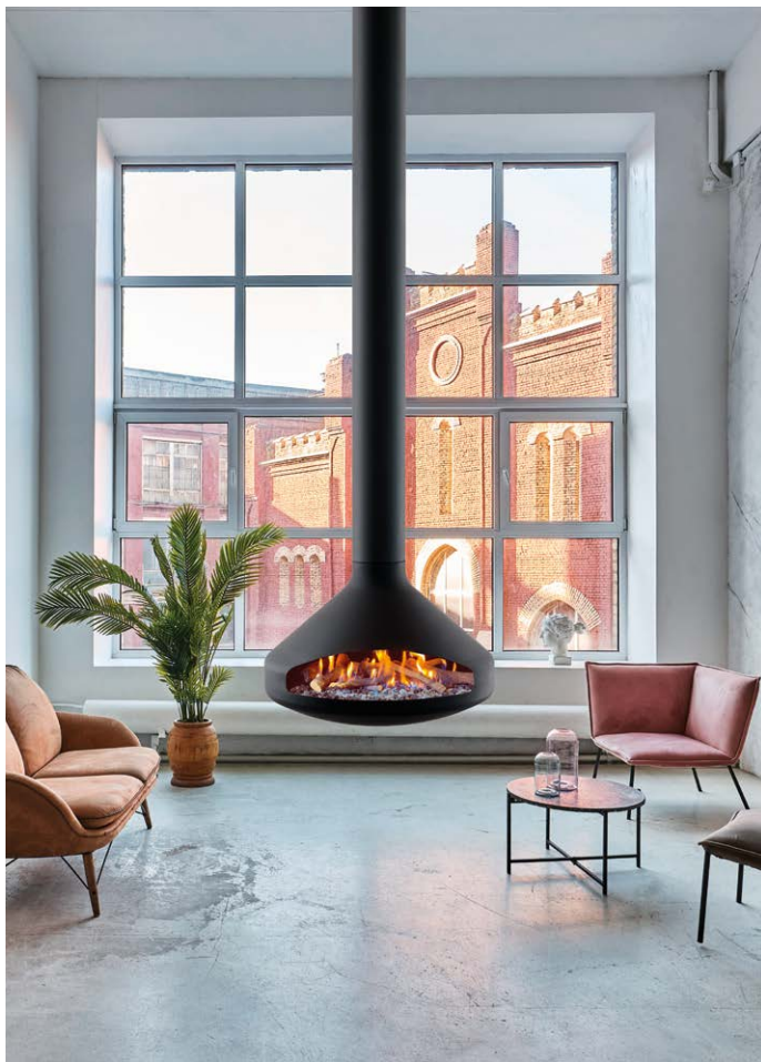
ERGOFOCUS GAS ©DOMINIQUE IMBERT